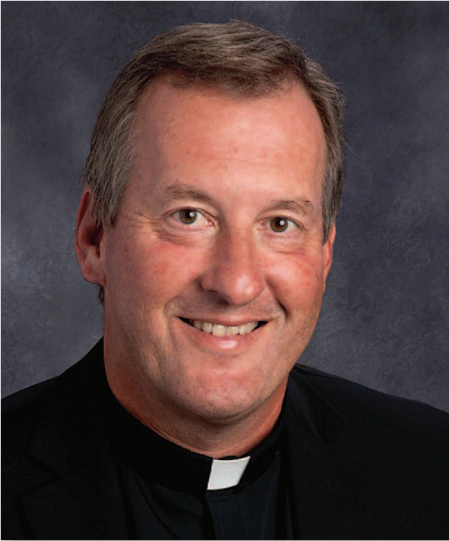
Fellow Gaels and Friends of Kennedy Catholic Preparatory School,

I t gives me great pleasure to announce to you the fall groundbreaking of our new athletic facility, the Sr. Janet Meehan Student Fitness Center. After having raised $1.2 million for the campaign, we are soon ready to begin phase 1 of the project – building the structure. As phase 2 gets underway we hope to quickly furnish the facility with state-of-the-art fitness equipment to ensure that all our students stay strong and our varsity athletic programs continue to thrive. With our Boys Baseball program rated number one in the Mid-Hudson Valley and our Girls Varsity Basketball program achieving the City Championship, it is very evident that our athletic programs are more than just successful – they are exceptional!