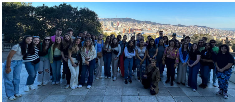
First stop: Barcelona - Mirador del Palau Nacional

When the four sophomores, 11 juniors and 25 seniors and their chaperones landed in Barcelona, Spain, they fought bravely through jet lag to travel further to La Rambla, the bustling heart of Spain's second largest city. While there, they toured Barri Gòtic, the Gothic Quarter, took in the architecture of Antoni Gaudí at Parc Guell and La Sagrada Familia Cathedral, and visited the Picasso Museum.