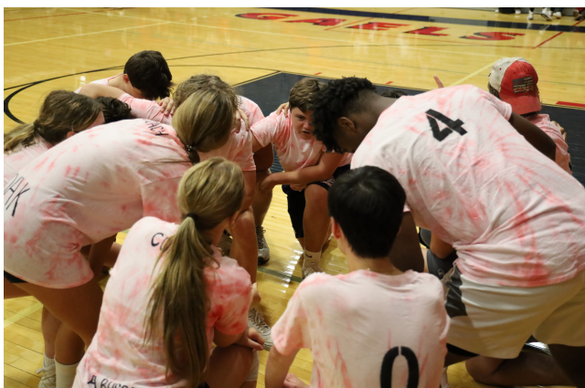
Senior boys strategize with coaches at first Powder Puff Volleyball