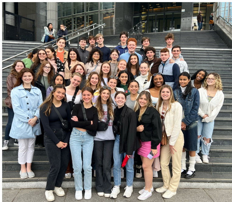
Last stop: Paris - Opéra National de Paris

Just two days into their journey, they set out north to cross the Pyrénées into Provence in southern France. Passing through the countryside as it slowly changed from the arid Spanish climate to the lush French landscape, the group stopped in the medieval town of Carcassonne, whose ramparts and towers are so well preserved that they have been featured in movies. Upon arrival in Avignon, the picturesque medieval "City of Popes," the group enjoyed authentic French cuisine and a stroll around the piazza.