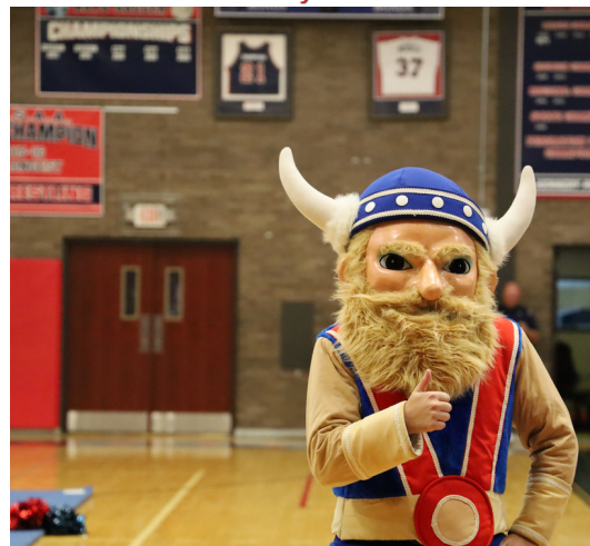
The Gael works the crowd before Pep Rally