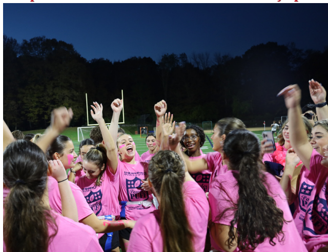
Seniors girls get pumped for Annual Powder Puff Football