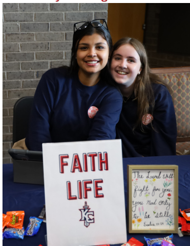
Annual Club Expo