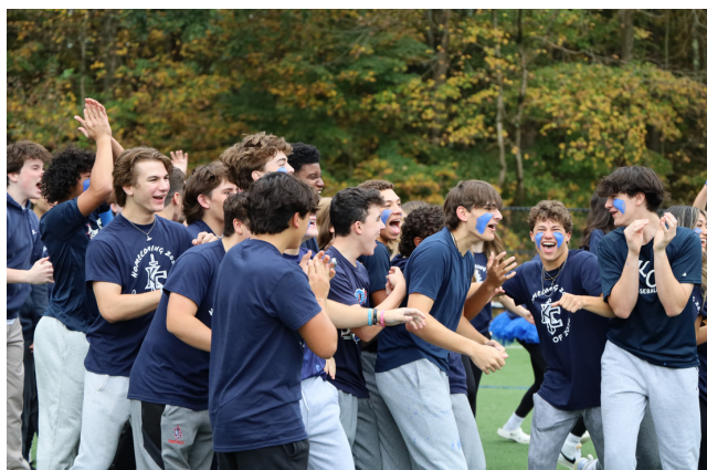
Sophomores celebrate at Annual Homeroom Olympics

For seniors, homecoming week is a bittersweet time, as it marks the beginning of the end of high school. While there may be a touch of sadness, it's a time to look back and reflect on all of the accomplishments we have had at Kennedy. The memories we create throughout homecoming are something we have to cherish for the rest of our lives. Ultimately, homecoming is a time to look forward to the future, while knowing we can always return home. Once a Gael, always a Gael!